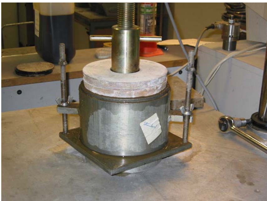
Figure 3 CBR bearing capacity test

The loading is shown in Figure 3. The lead rings around the piston are used to simulate weight of overlaying materials.