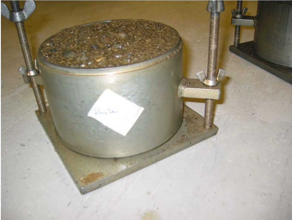
Figure 1 Sample with DUSTEX after compaction